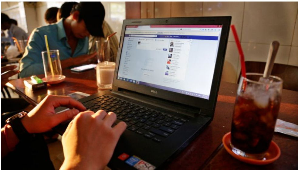
People surf the internet at a café near Phnom Penh's Wat Phnom.

Cambodia has approved the establishment of a “national internet gateway” (NIG) through which all of the Kingdom’s online traffic will be routed.